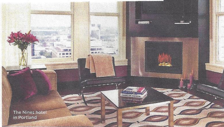
The Nines hotel in Portland