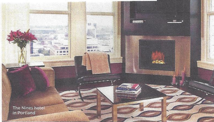
The Nines hotel in Portland